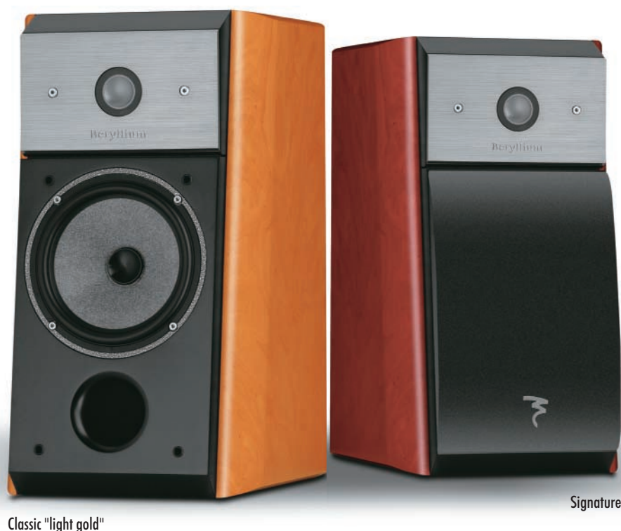
Classic "light gold"