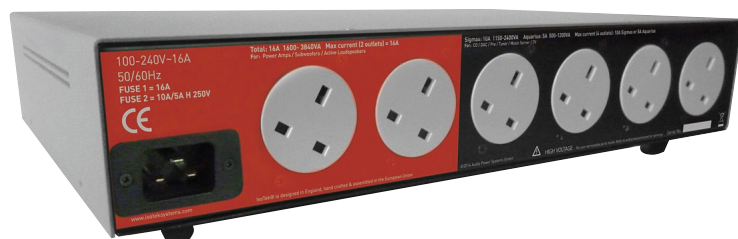
The two sockets (16Amp) in the red coloured area are for high power components such as amplifiers, while source components use the four lower power (10Amp) sockets in the black section. The IEC mains input is on the left.”

with a weight to the lower notes that was made of pure granite, yet seemed to have the agility of an Olympic athlete. Mid and upper band sounds gained in colour, texture and definition, so the complex section towards the end of the second movement, where the orchestra, organ and pianos combine, had a clarity that I have never heard through this system.